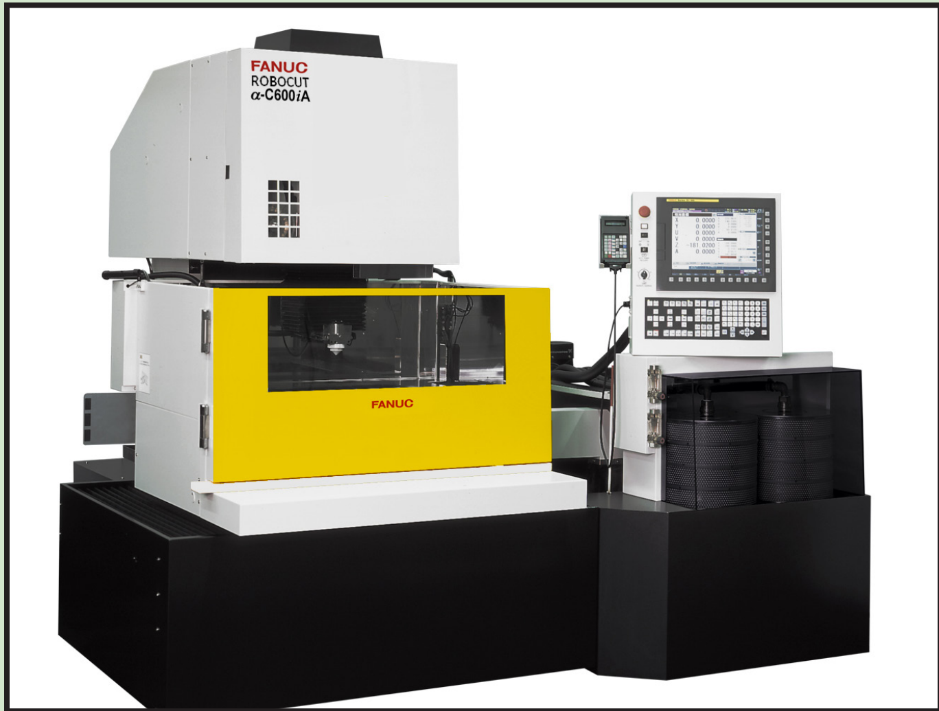
FANUC RoboCut C600iA Wire EDM (from Methods Machine Tools, Inc.) Offers Improved Accuracy, Speed, Finish and Efficiency.